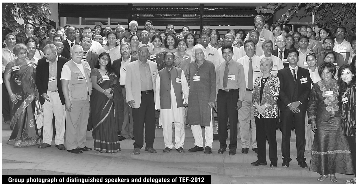
Group photograph of distinguished speakers and delegates of TEF-2012